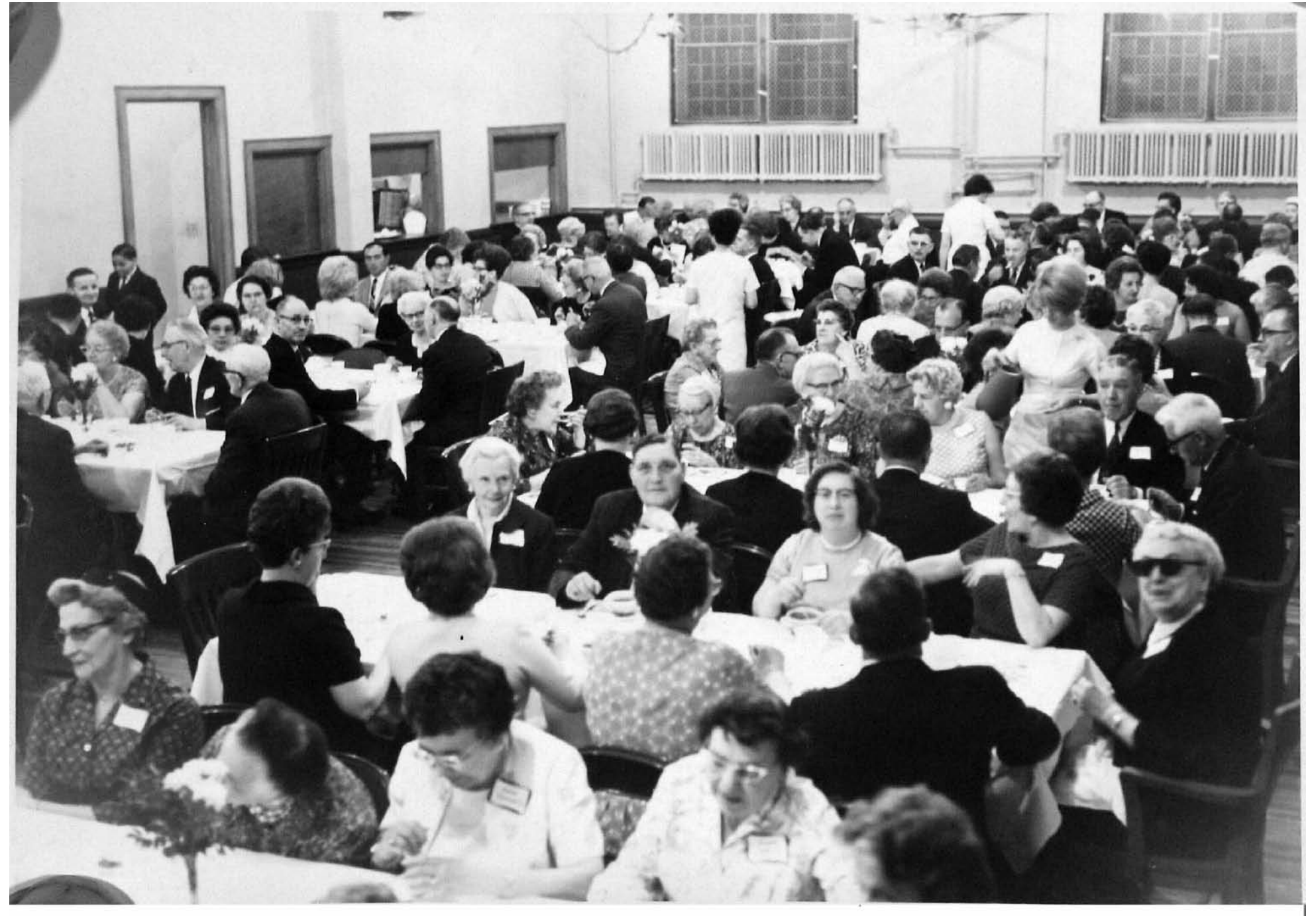
75th Anniv Banquet 1967