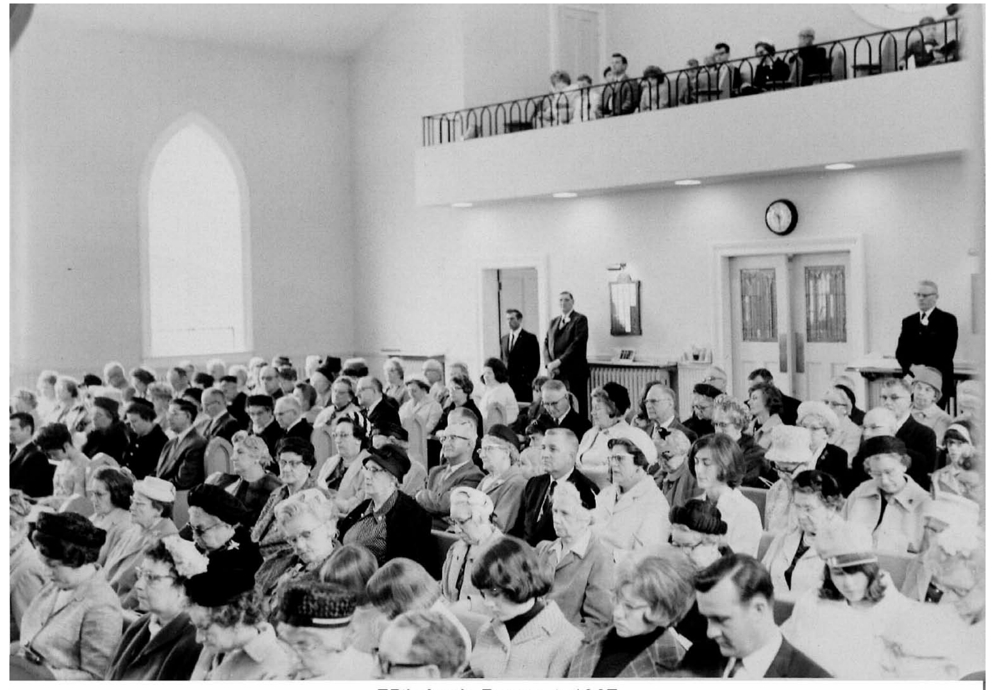
75th Anniv Banquet 1967