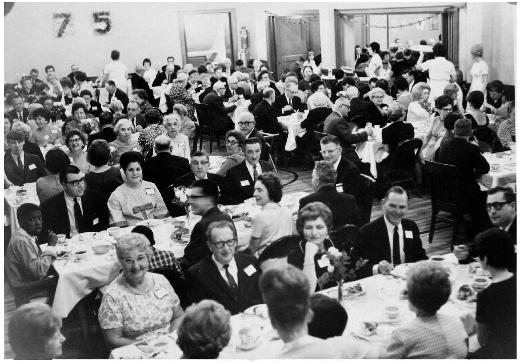
75th Anniv Banquet 1967