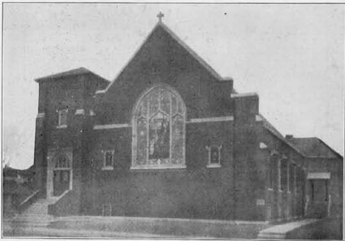
The New Edifice