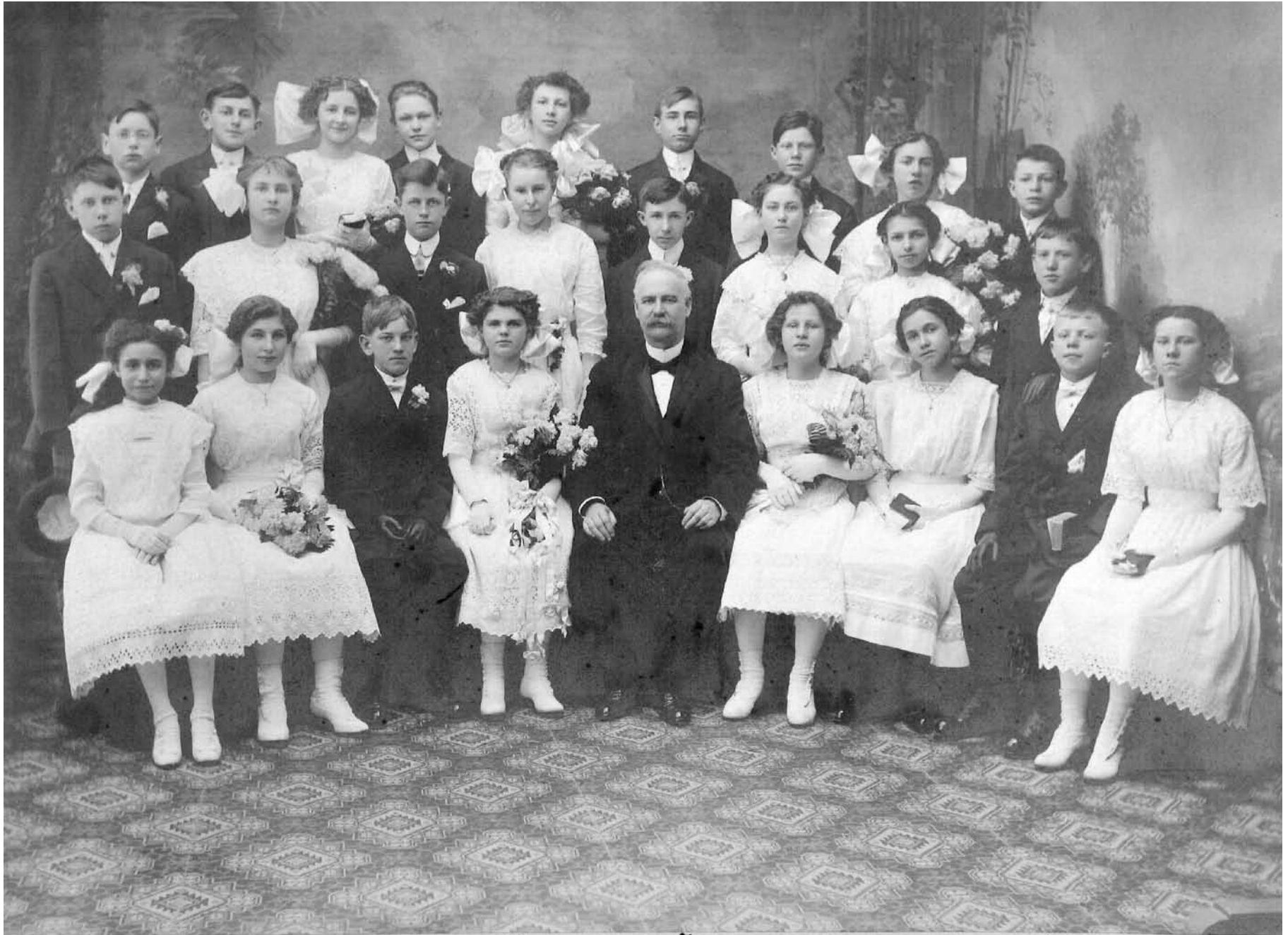
St. Paul's Church - Class of 1913