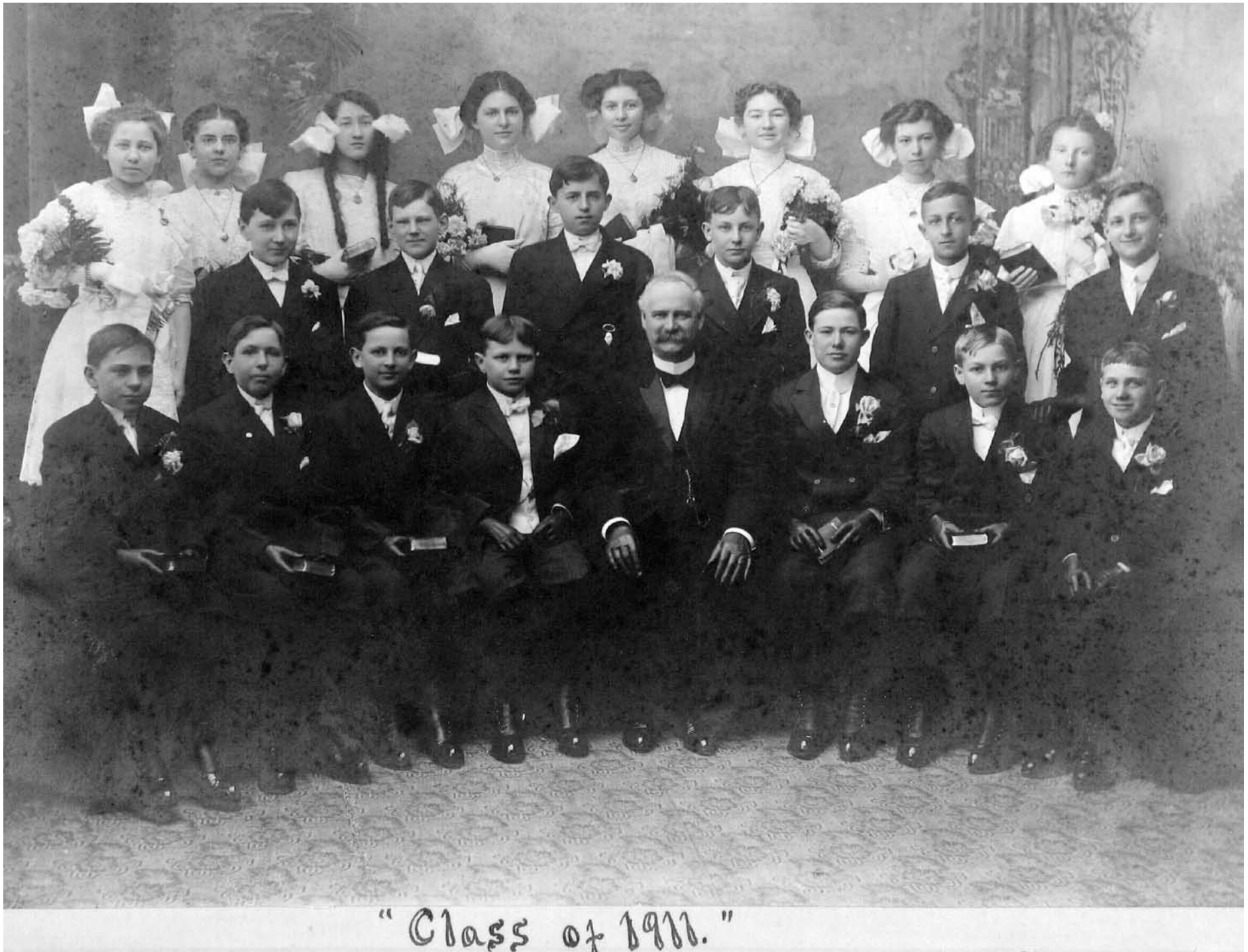
"Class of 1911."