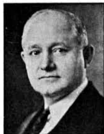
President of the Board 1910-1934