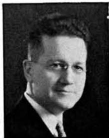
President of the Board 1944-