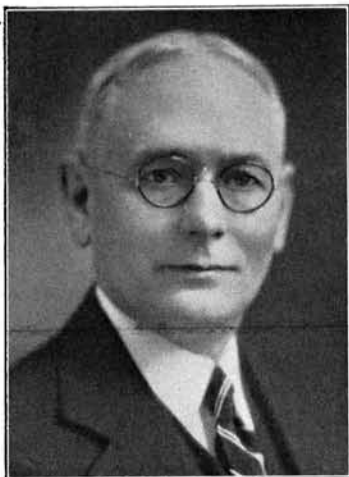
President of the Board 1934-1944